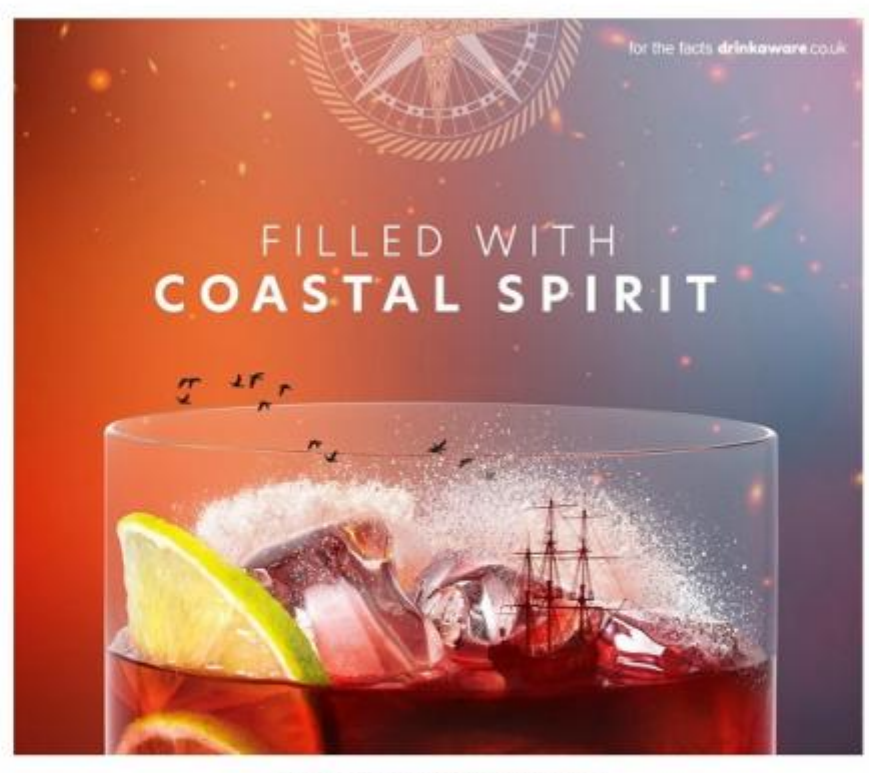
COPELAND OVERPROOF RUM